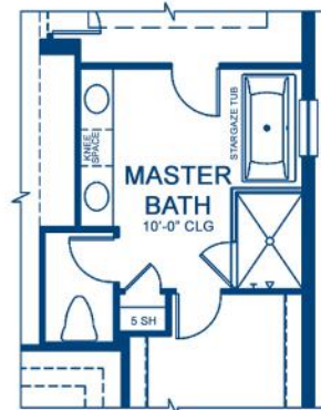
OPT. STARGAZE RELAXATION MASTER BATHROOM

*Laundry tub (LT) may be optional per community specifications