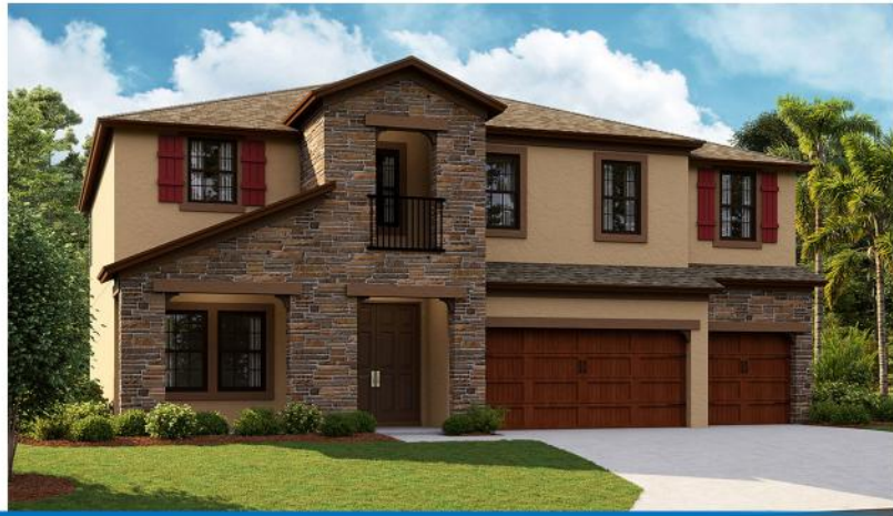
Tuscan B TUS2

"Garage door windows and coach lights may not be included feature per rendering based on community features. Please confirm whether included or optional with your Community Sales Manager."