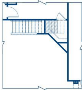
OPT. ANGLED WALL W/ EXPANDED CLOSET