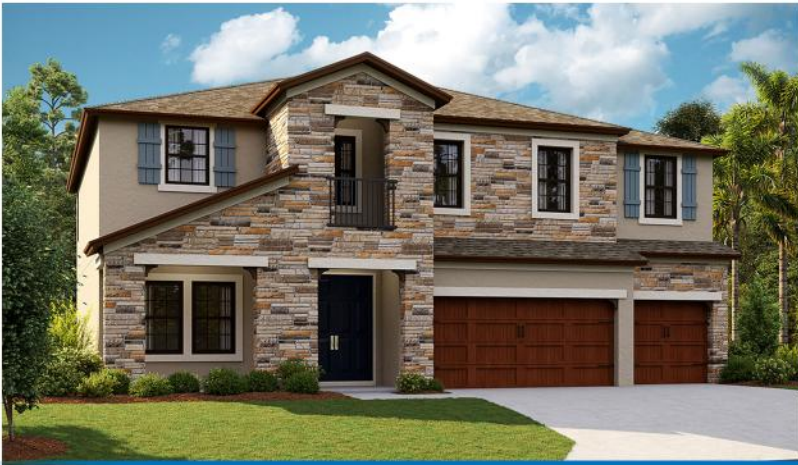
Tuscan A TUS5