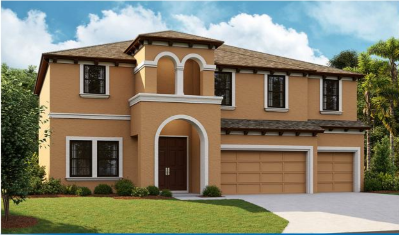
Mediterranean B FMD1