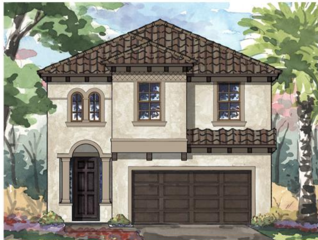
Mediterranean B FMD3