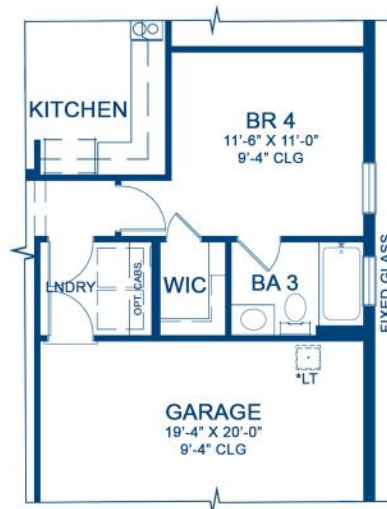
OPT. BATH 3 (+34 A/C S.F. -34 S.F. AT GARAGE)